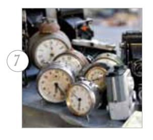
Your flea market finds will look adorable in that modern mantle.